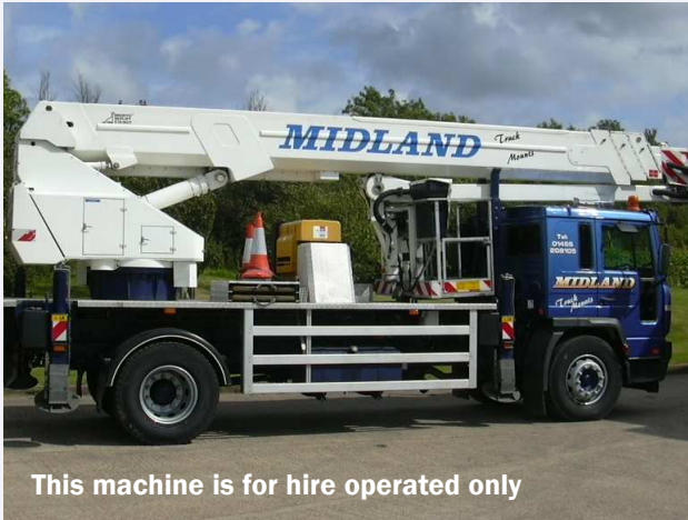
This machine is for hire operated only